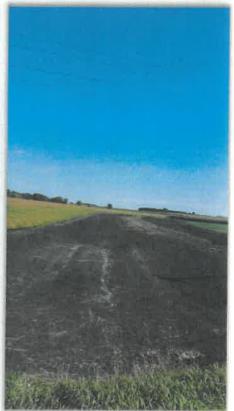
33 Lowville Waterway repair

CONTACT: SHELLY LEWIS DISTRICT ADMINISTRATOR (507) 836-6990 EXT. 102 SLEWIS@CO.MURRAY.MN.US